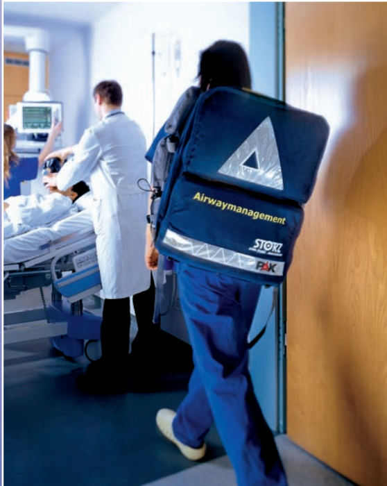
Auch als Airwaymanagement-Rucksack erhältlich